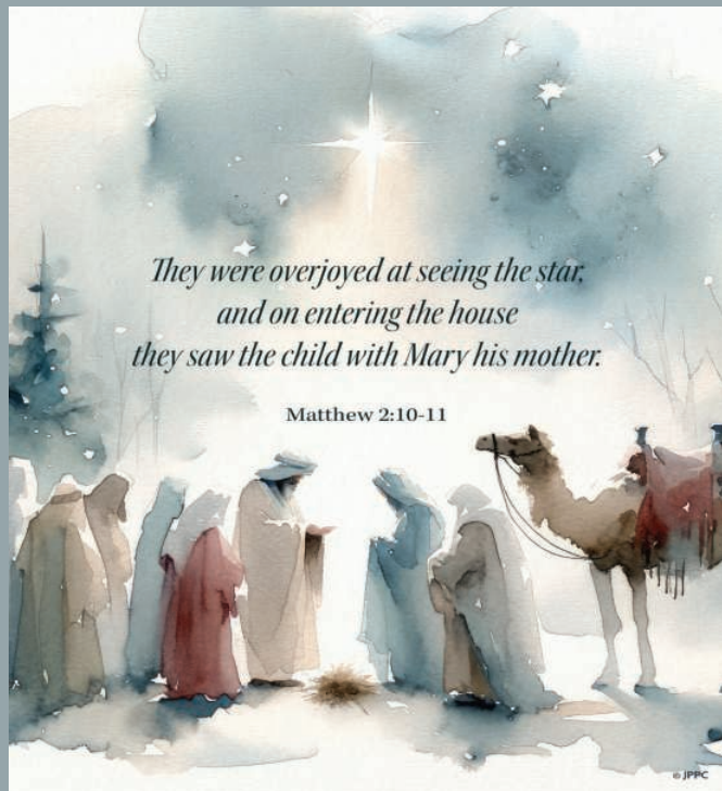
Epiphany of the Lord

The readings for next Sunday are shared here to give you a chance to meditate on them in preparation for Mass.