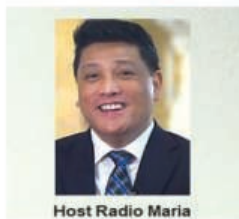
Host Radio Maria