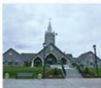
St. Teresa of Calcutta